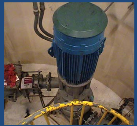
Existing Pump & Motor