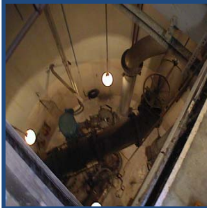
Existing Pumps – View From Above